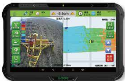
T100 Smart Tablet

Build-in Radio Modem, IP67, 10.1 inch Screen