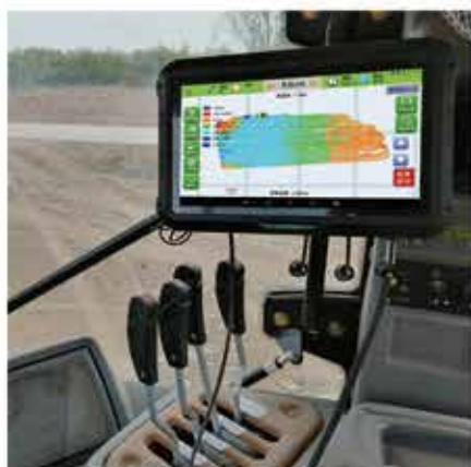
1. Digitizing, Visualization