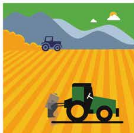
3. Datum Plane Real Time Fine-Tuning